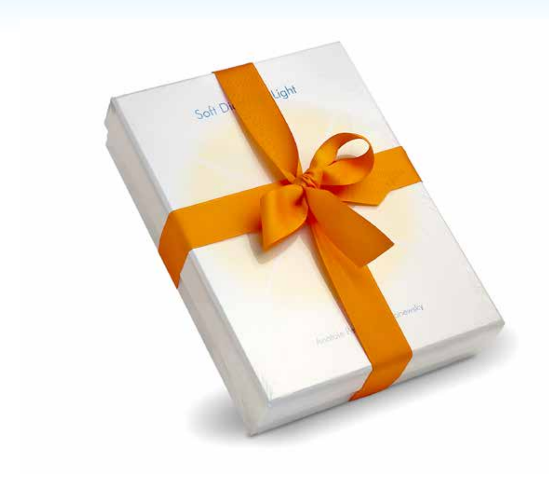
Soft Diamond Light package